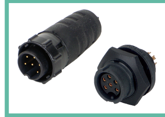
EN3 / EN2

Medical, food service, transportation, GPS, marine and general industrial electronic applications