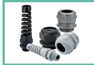
Strain Relief Fittings

Food & Beverage, Lighting, Telecom/ Communication, Security, Medical, Robotics, Packaging, Automotive, Marine, Renewable Energy